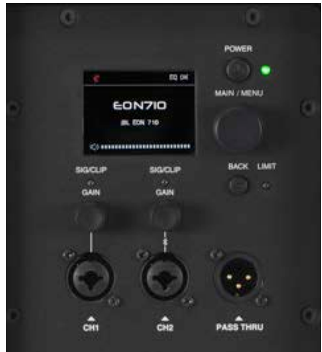
REAR PANEL CONNECTIONS

The JBL EON710 10-inch loudspeaker, part of JBL's new EON700 Series of powered PAs, brings advanced DSP and control to portable systems for live sound and installed applications, with class-leading volume and clarity and comprehensive features that make setup and operation a breeze.